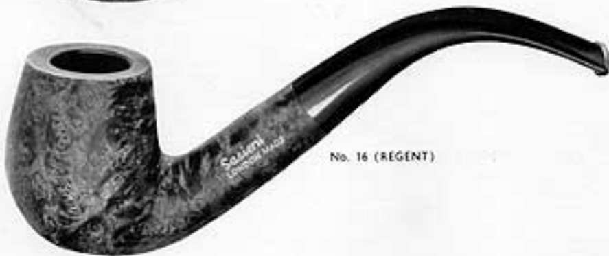
No. 16 (REGENT)