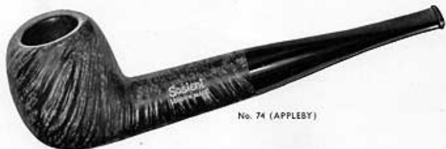
No. 74 (APPLEBY)