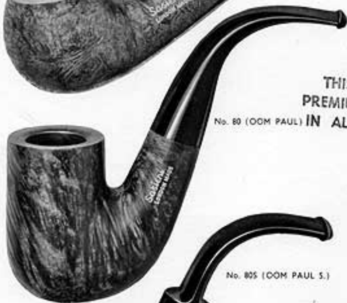
No. 80 (OOM PAUL) IN ALL RANGES