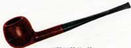
LITEWATE No. 30