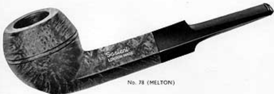
No. 78 (MELTON)