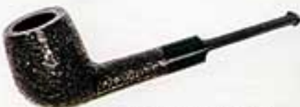
LITEWATE RUSTIC No. 35