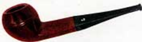
LITEWATE No. 77