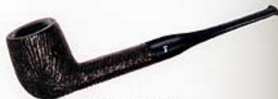
FANTAIL RUSTIC No. 11