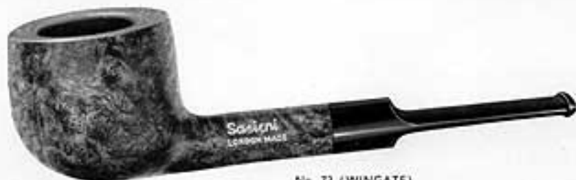
No. 73 (WINGATE)