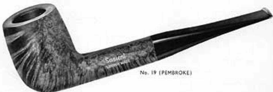
No. 19 (PEMBROKE)