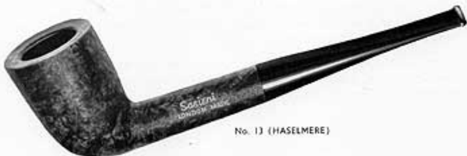
No. 13 (HASELMERE)