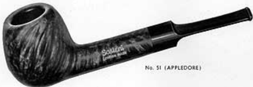
No. 51 (APPLEDORE)