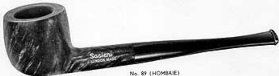
No. 89 (HOMBRIE)