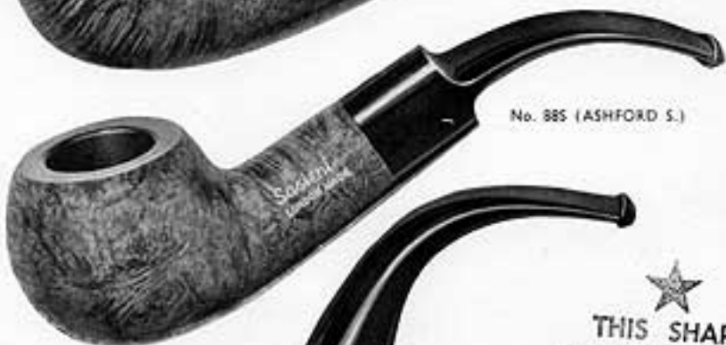
No. 88S (ASHFORD S.)