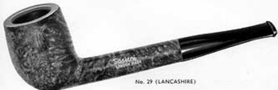
No. 29 (LANCASHIRE)