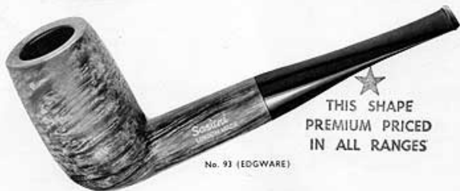
No. 93 (EDGWARE)

★ THIS SHAPE PREMIUM PRICED IN ALL RANGES