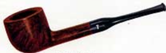
FANTAIL No. 73