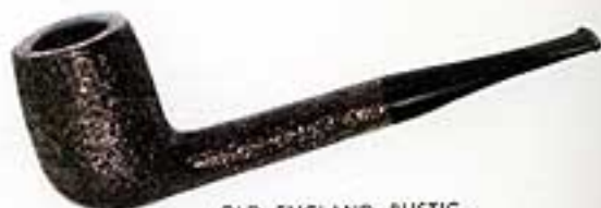
OLD ENGLAND RUSTIC