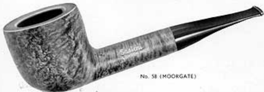
No. 58 (MOORGATE)