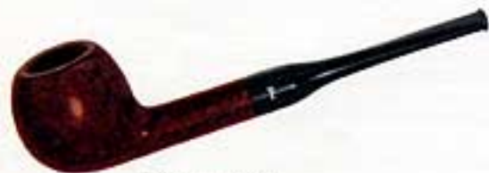
FANTAIL No. 30