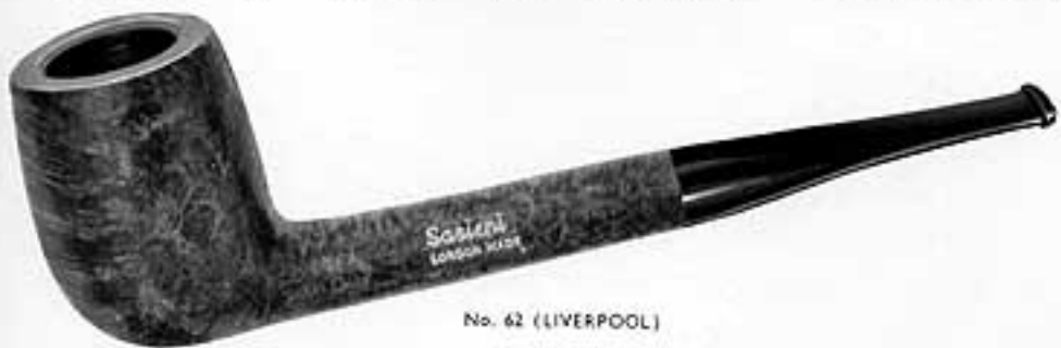
No. 62 (LIVERPOOL)