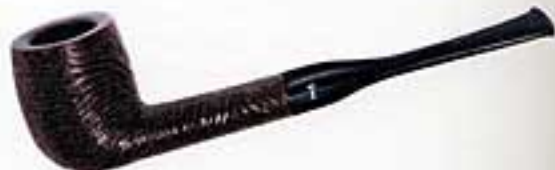
FANTAIL RUSTIC No. 10