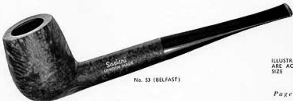
No. 53 (BELFAST)