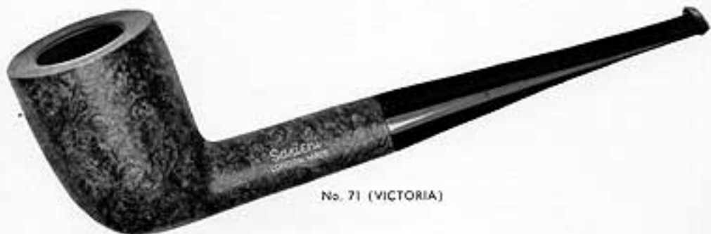
No. 71 (VICTORIA)