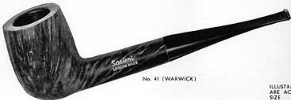
No. 41 (WARWICK)