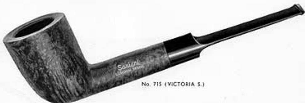
No. 715 (VICTORIA S.)