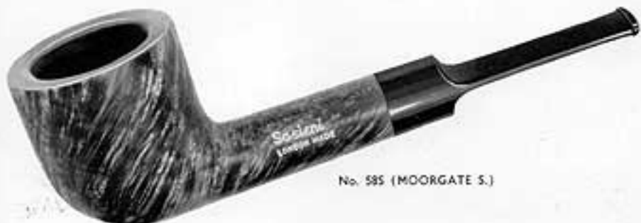
No. 585 (MOORGATE S.)