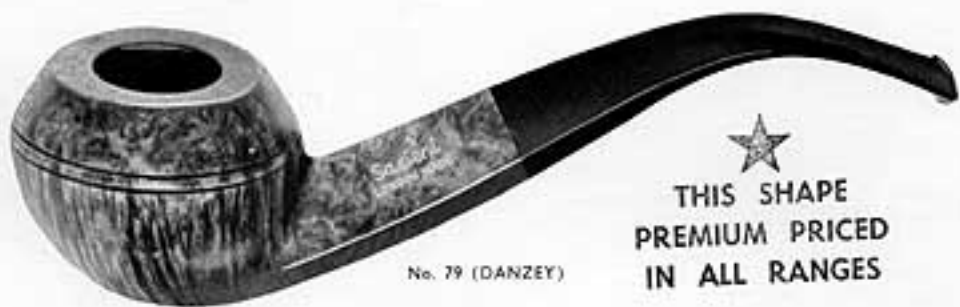
No. 79 (DANZEY)

★ THIS SHAPE PREMIUM PRICED IN ALL RANGES