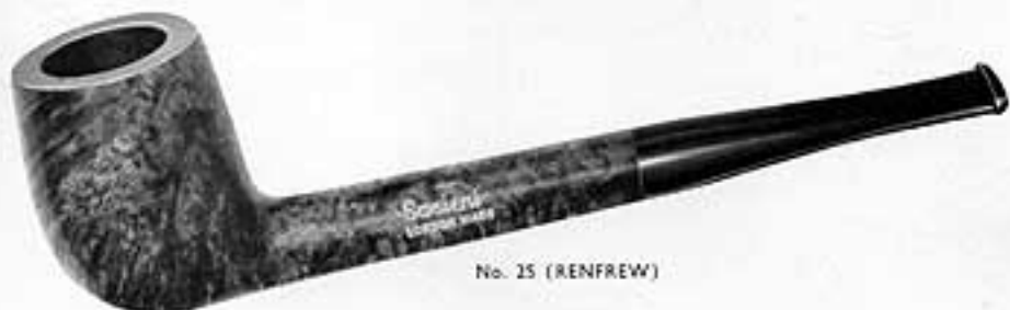
No. 25 (RENFREW)