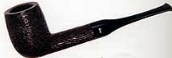
FANTAIL RUSTIC No. 19