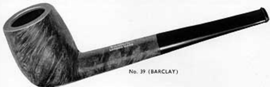
No. 39 (BARCLAY)