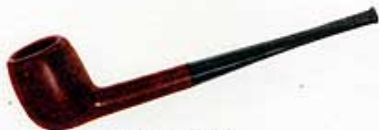
LITEWATE No. 23