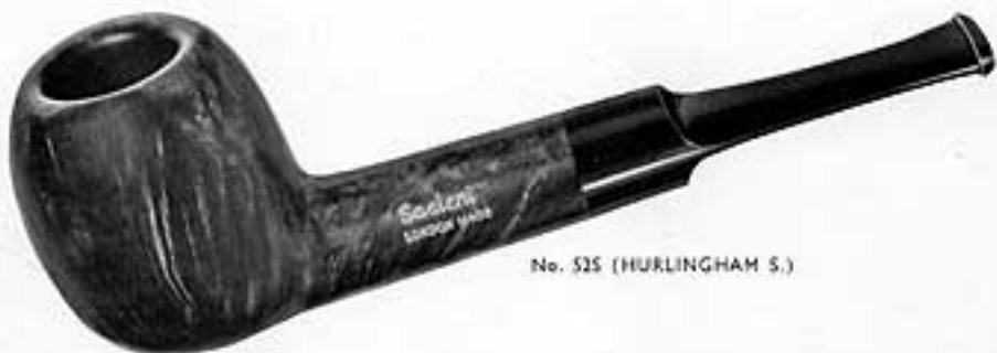
No. 52S (HURLINGHAM S.)