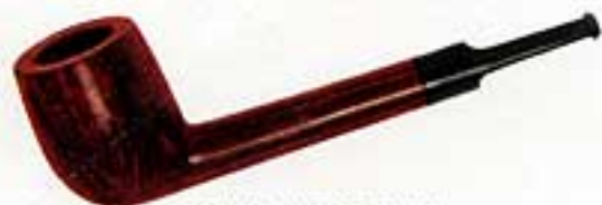
ROYAL STUART PLUM