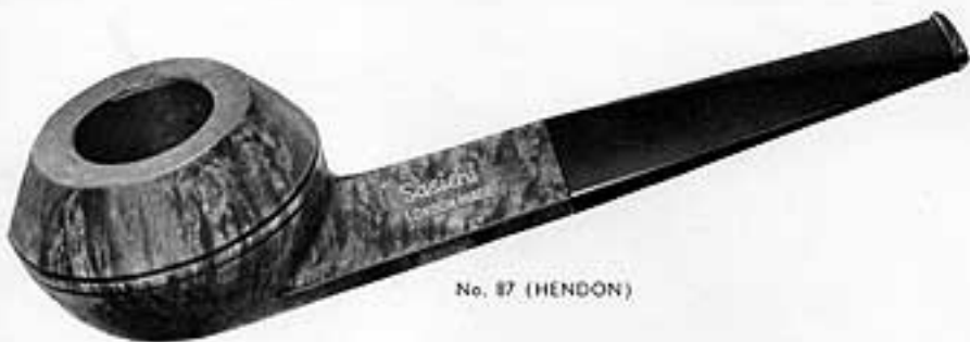
No. 87 (HENDON)