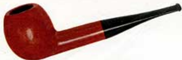
ROYAL STUART NATURAL