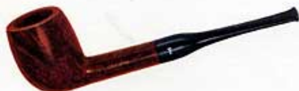
FANTAIL No. 12