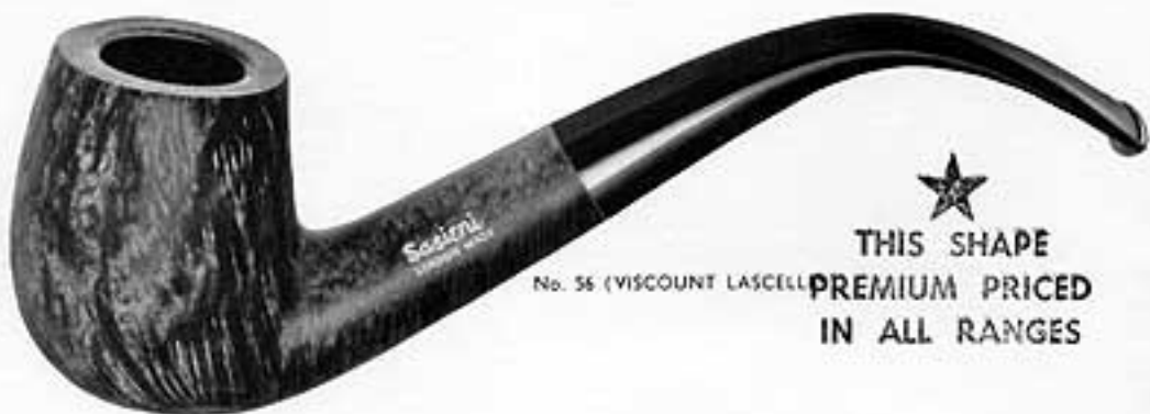
No. 56 (VISCOUNT LASCELLE) THIS SHAPE PREMIUM PRICED IN ALL RANGES