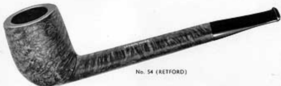
No. 54 (RETFORD)

★ THIS SHAPE PREMIUM PRICED IN 4 DOT RANGE