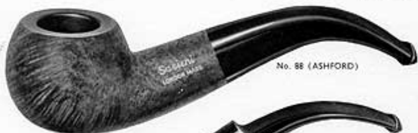
No. 88 (ASHFORD)