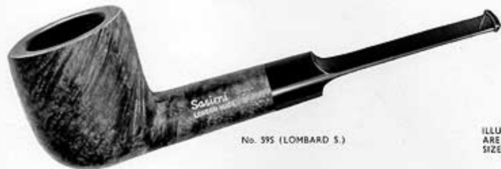
No. 595 (LOMBARD S.)