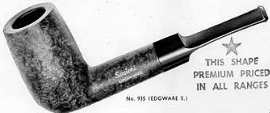
No. 93S (EDGWARE S.)

★ THIS SHAPE PREMIUM PRICED IN ALL RANGES