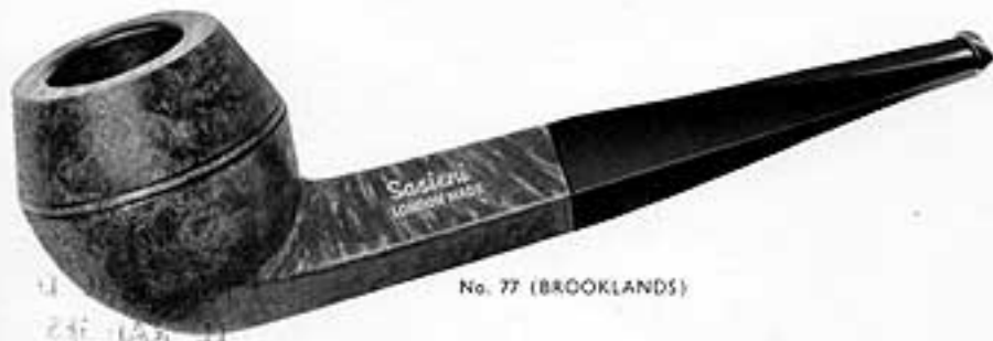
No. 77 (BROOKLANDS)