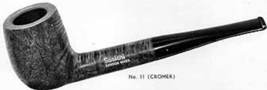
No. 11 (CROMER)