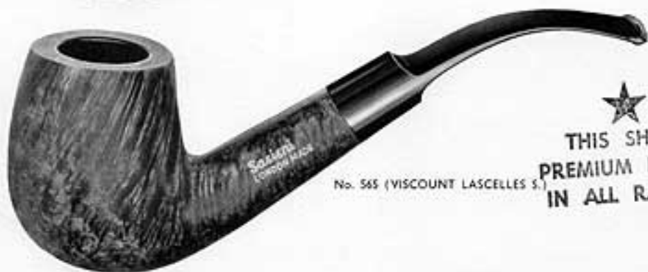
No. 56S (VISCOUNT LASCELLES S.) THIS SHAPE PREMIUM PRICED IN ALL RANGES