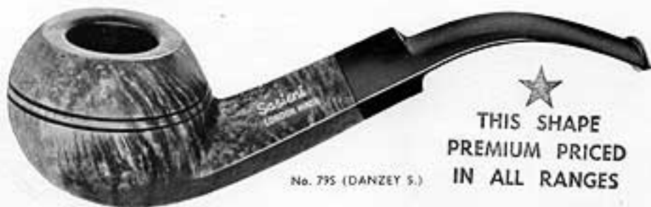
No. 79S (DANZEY S.)

★ THIS SHAPE PREMIUM PRICED IN ALL RANGES