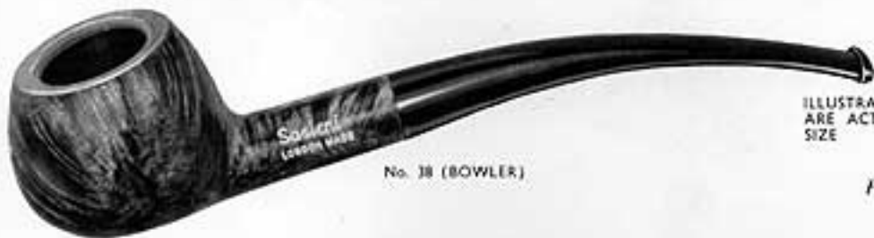
No. 18 (BOWLER)