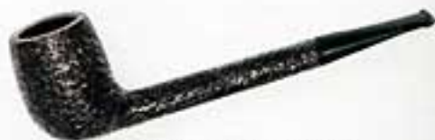
LITEWATE RUSTIC No. 25