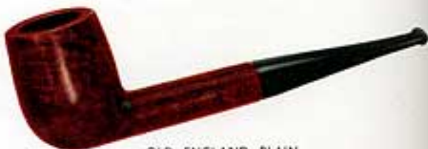
OLD ENGLAND PLAIN