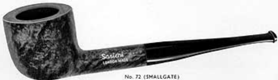
No. 72 (SMALLGATE)