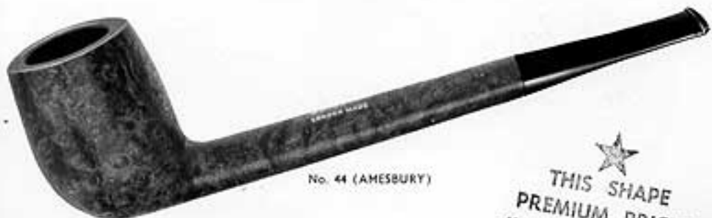
No. 44 (AMESBURY)

★ THIS SHAPE PREMIUM PRICED IN 4 DOT RANGE