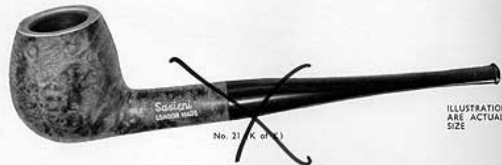
No. 21 (K. of F.)