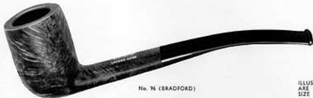
No. 95 (BRADFORD)