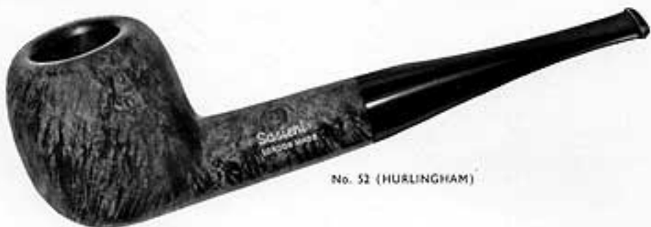
No. 52 (HURLINGHAM)