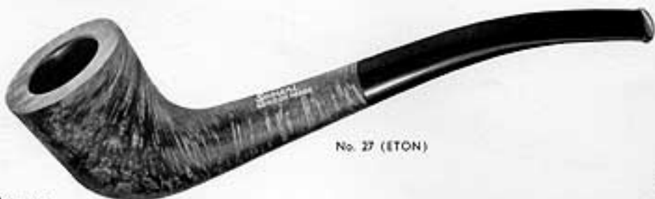
No. 27 (ETON)