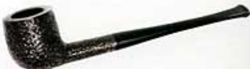
LITEWATE RUSTIC No. 58