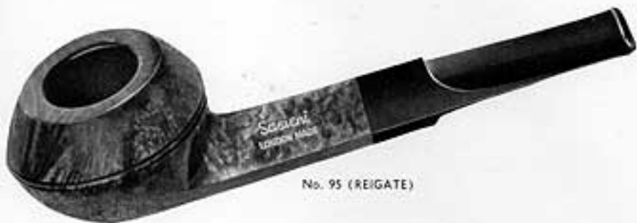
No. 95 (REIGATE)