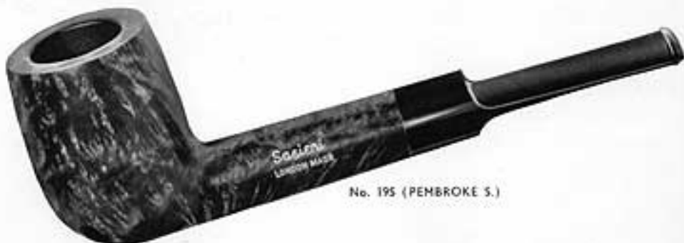
No. 195 (PEMBROKE S.)