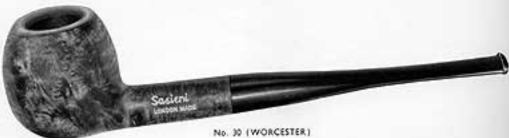
No. 30 (WORCESTER)