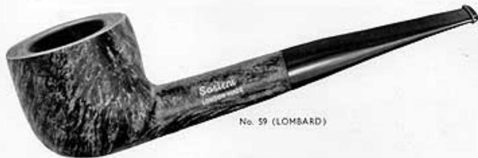
No. 59 (LOMBARD)