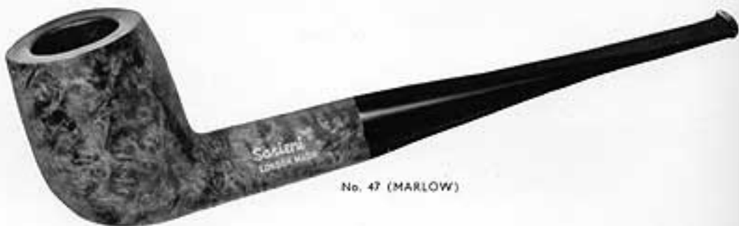
No. 47 (MARLOW)