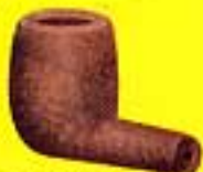
BOWL FINISHED BY HAND

This, then, was the material that the COMOY family set out to master. That they did so was due to long years of painstaking and elaborate experiment. Secret processes, still used to this day and still exclusive to COMOY'S, were originated and developed, so that every COMOY'S pipe is the end-product of over 140 years of unbroken experience, combining the finest raw material with superlative craftsmanship.