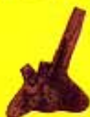
TEN YEARS OLD BRIAR ROOT