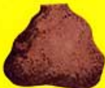
ONE HUNDRED YEARS OLD