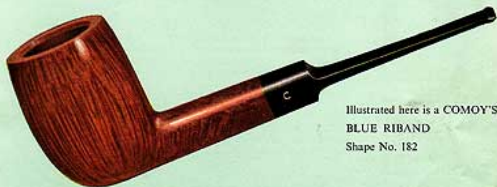
Illustrated here is a COMOY'S BLUE RIBAND Shape No. 182

Each bowl combines complete absence of flaws with a beauty of grain which, when hand polished to its ultimate perfection, will bring joy to the heart of the connoisseur. More than 100 separate and individual operations go into the making of these collectors' pieces.