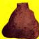
FIFTY YEARS OLD