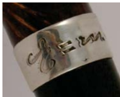
close up of band decoration