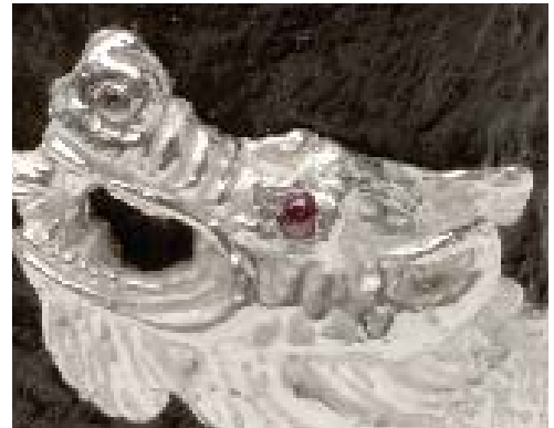
Close up Ruby eye