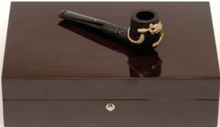
Lacquered presentation case