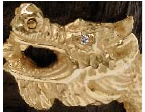
Close up Diamond eye