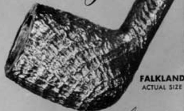
FALKLAND ACTUAL SIZE