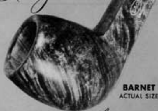
BARNET ACTUAL SIZE