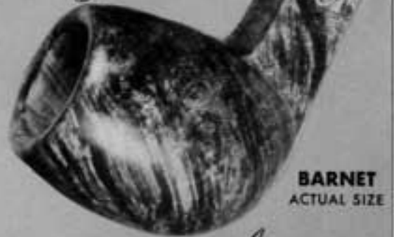
BARNET ACTUAL SIZE