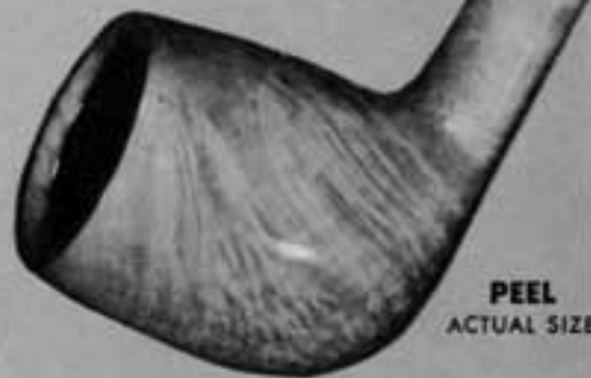
PEEL ACTUAL SIZE