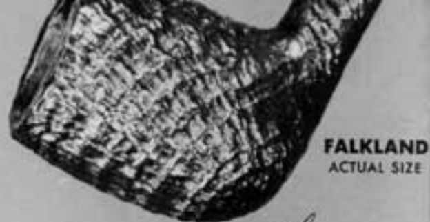
FALKLAND ACTUAL SIZE