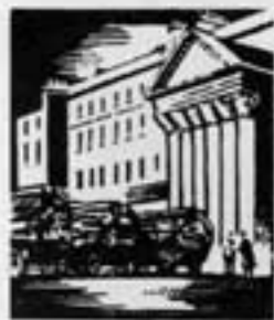
LOEWE'S pipe shop opened in the Hay market in 1856