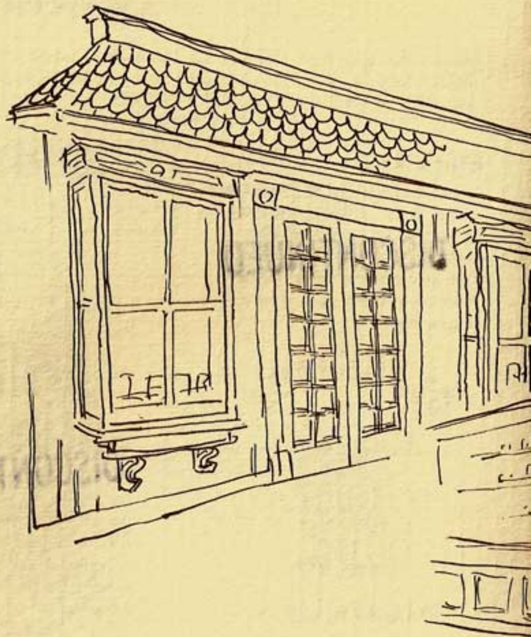
Above is pictured the new walk-in cigar humidor and blending bar at our University Avenue store.

Raspberry. The most aromatic of the five, this blend is fresh and sweet with the smell of fresh raspberries sure to turn many heads.