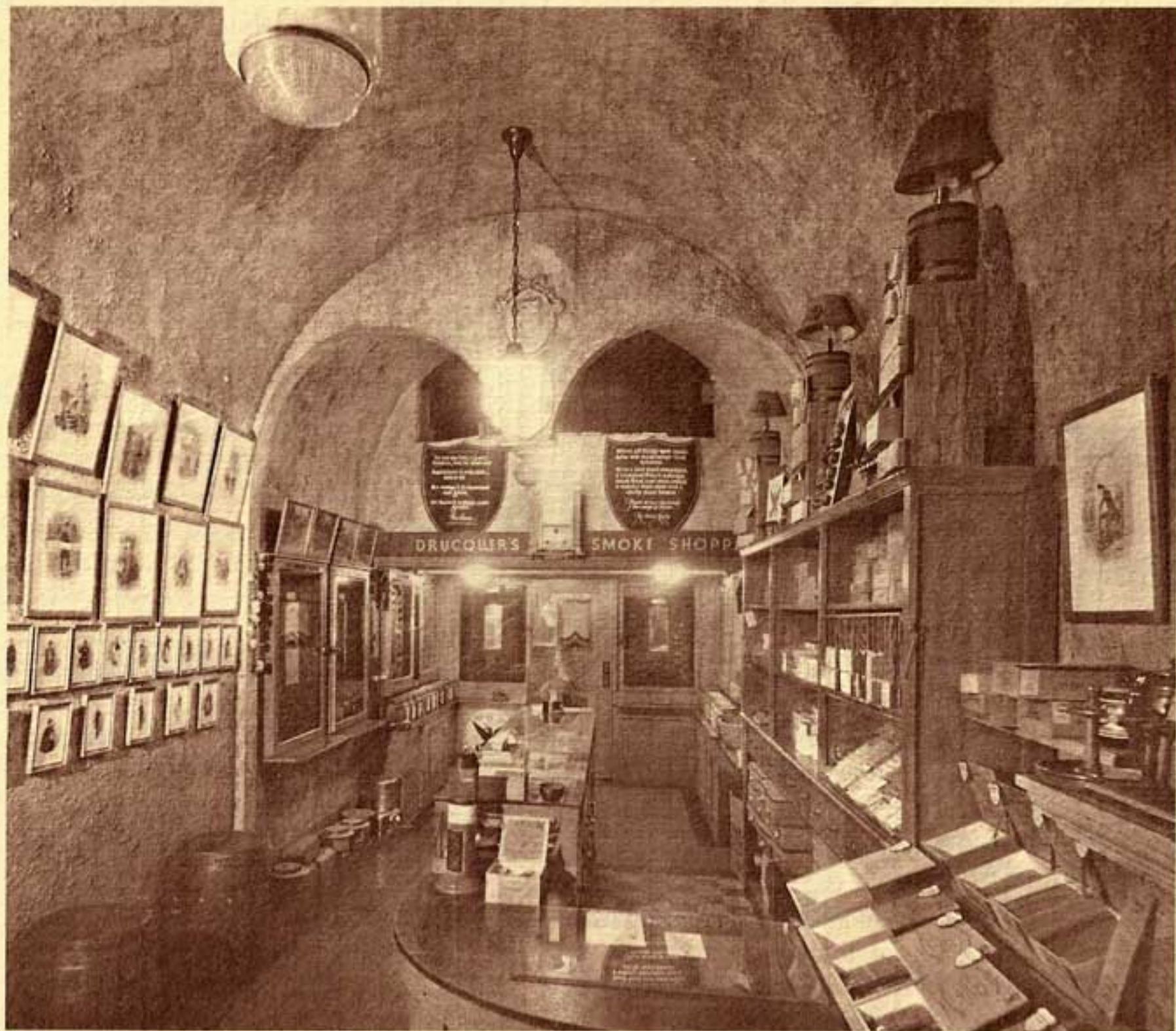
2201 Shattuck Avenue - 1938