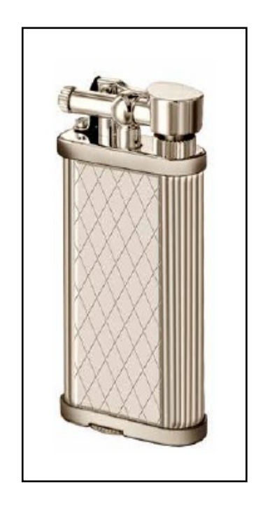
ULA13013 UNIQUE POCKET Crosspatch GP