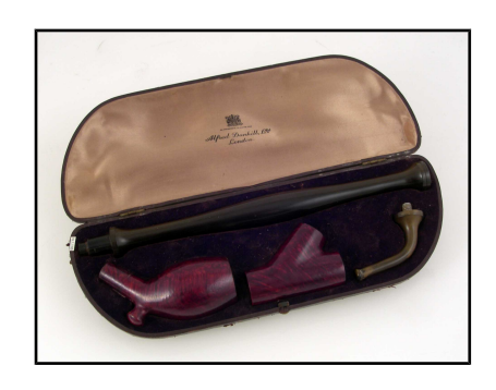
Archive Pipe in special case (1936)

This hand-turned pipe is composed of four components. Briar was used to turn both the pipe bowl and Y-shaped connection piece while the stem and the mouthpiece are hand-worked from solid vulcanite rods.